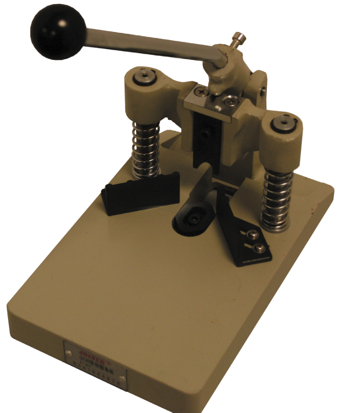
Dumor Heavy Duty Corner Rounder