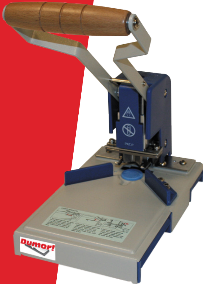
Dumor Light Duty Corner Rounder