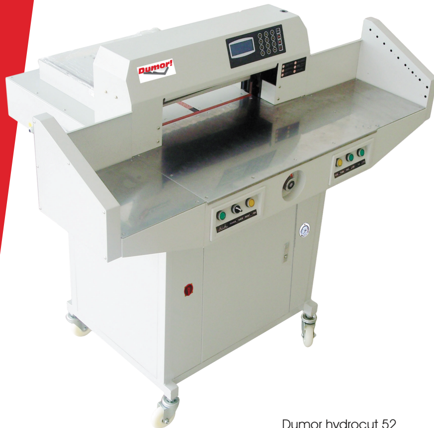
Dumor hydrocut 52